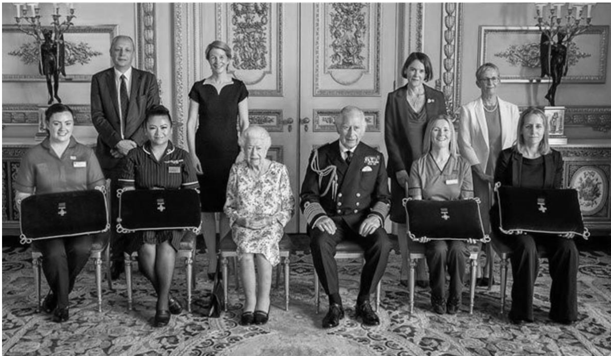
HRH Queen Elizabeth II photographed with representative NHS colleagues in July 2022, when she awarded the NHS the St George's cross

Welcome to the September edition of our newsletter, which was briefly delayed due to the period of mourning for her Royal Highness, Queen Elizabeth II. We value and appreciate her acknowledgement of the work of the NHS in London, particularly during the height of the pandemic. The photograph below captures her commendation of NHS staff whose contributions made such a difference to public health. Thereafter, an update on the work of the psychological professions in the capital.